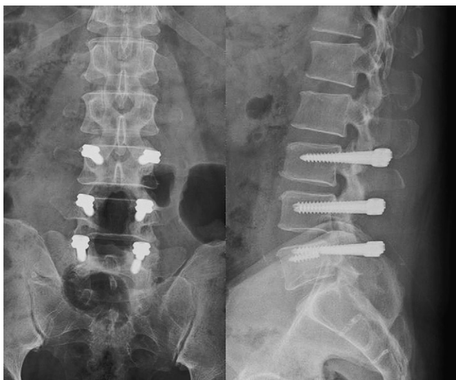
Fig. 2. The patient complained of progressive intractable low back pain 7 months after surgery. Repeat radiography revealed loosening of the right L5 pedicle screw and breakage of the left L5 pedicle screw.

Pedicle screw fixation is indicated for the management of numerous spinal disorders and deformities. It offers the advantages of immediate stabilization, higher rates of spinal fusion, and easy contouring. However, the complications associated with the use of pedicle screws have been encountered and reviewed in several studies. 9–11 One of the most common complications mentioned in these reports is screw breakage, which occurs in 1–11.2% of inserted screws and in 0.4–24.5% of treated patients. An instrumented posterior fusion procedure resulting in pseudarthrosis can lead to pedicle screw or rod breakage. With any instrumented fusion, it is a race between failure of the instrumentation and healing of the fusion procedure. 12