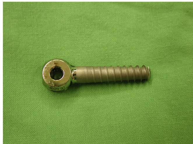
Fig. 3. The broken pedicle screw removed from the left L5 pedicle.

The intractable back pain and associated sciatica improved substantially after surgery. The patient was advised to wear